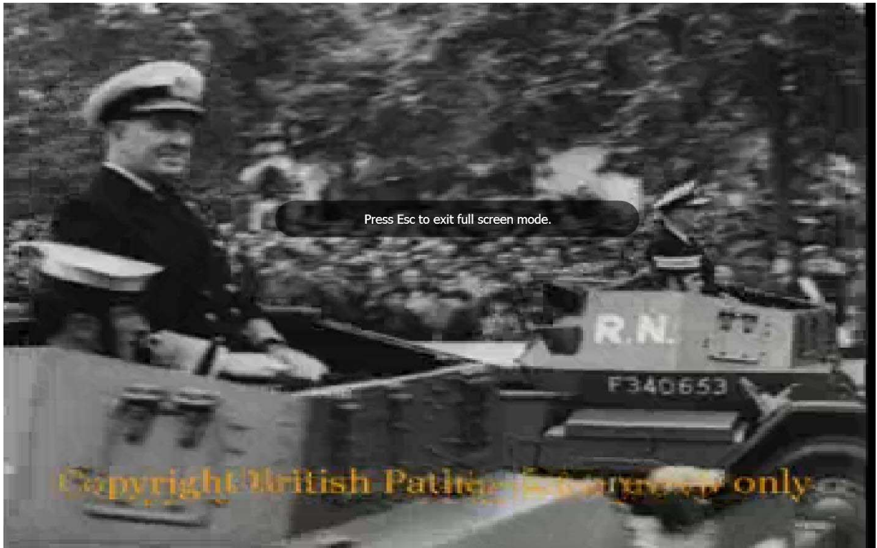
Daimler scout car F340653 with officer from The Royal Navy