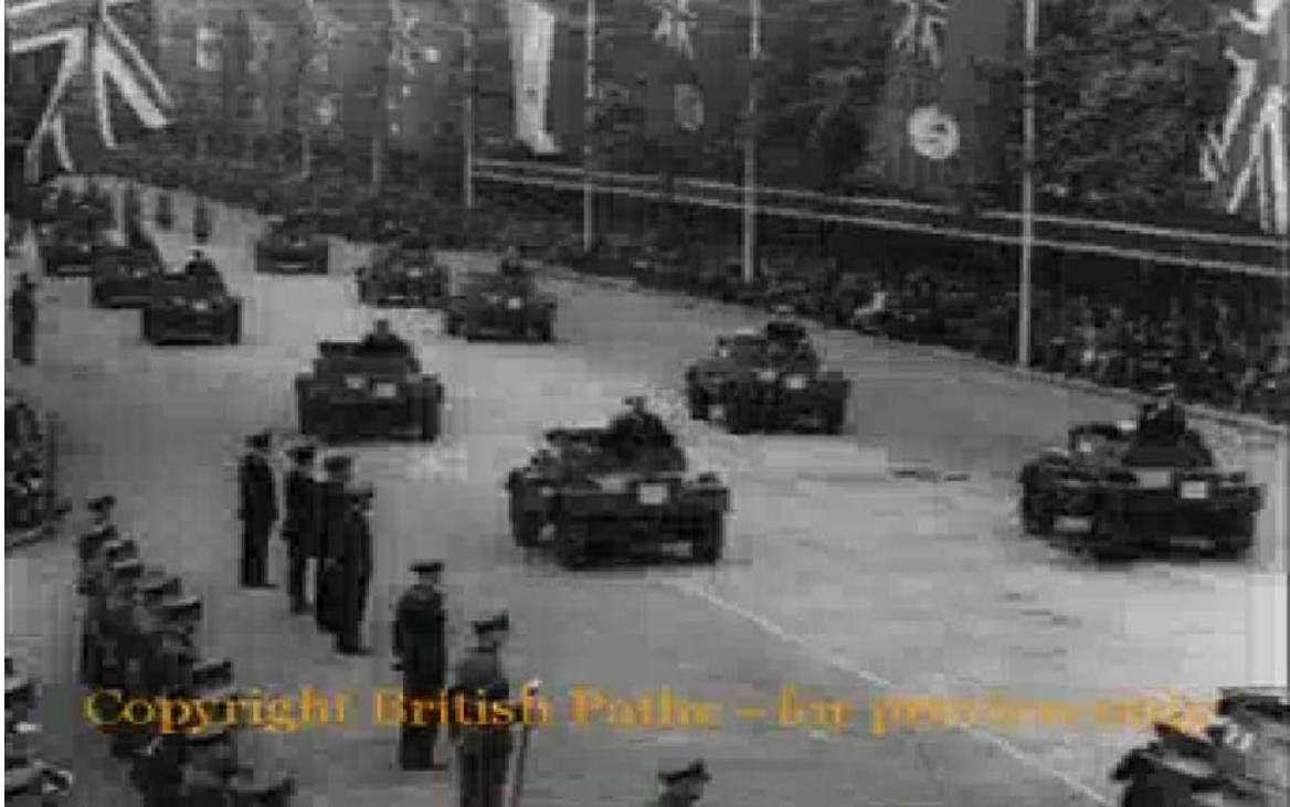
Daimler scout cars progress along the Mall

The London Victory Parade of 1946 was a British victory parade held after the defeat of Nazi Germany and Japan in World War II. It took place on June 8, 1946. The celebration mainly encompassing a military parade starting at three points which converged at the city. The march then proceeded to the Mall where each regiment and service passed the saluting base.