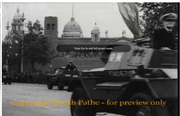
Daimler scout car F340675 with officer from The Royal Navy