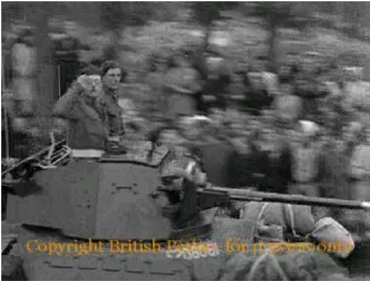
Description: Daimler armoured car F 208081 of the 11 th Hussars iin Berlin.