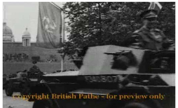
Daimler scout car F340807 with officer from First or Second army group