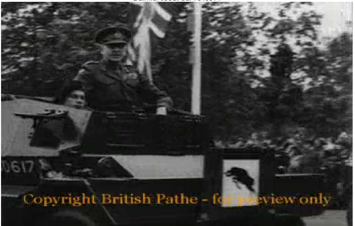
Daimler scout car F340617 with officer from XXX Corps