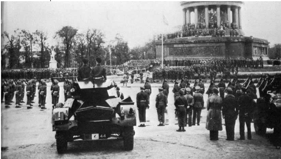
Description: DAC at the Berlin flagCeremony