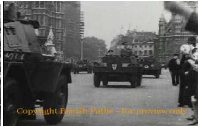
Daimler scout car F340314