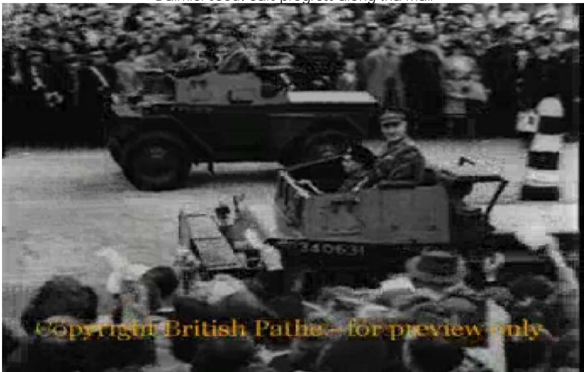
Daimler scout car F340631